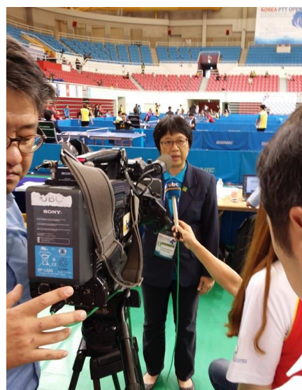
Interview by local TV