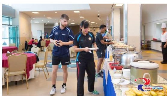
Lunch served at the venue