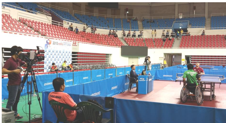
News coverage by STN Sports

LOC also sending news and some photos to local newspaper.